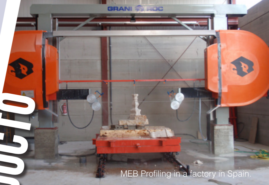
MEB Profiling in a factory in Spain.