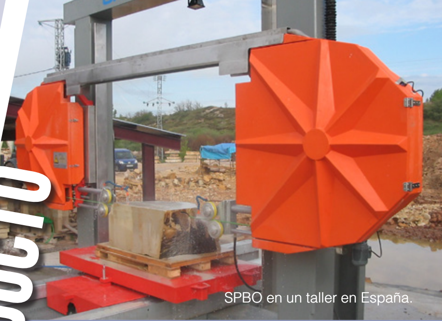
SPBO en un taller en España.